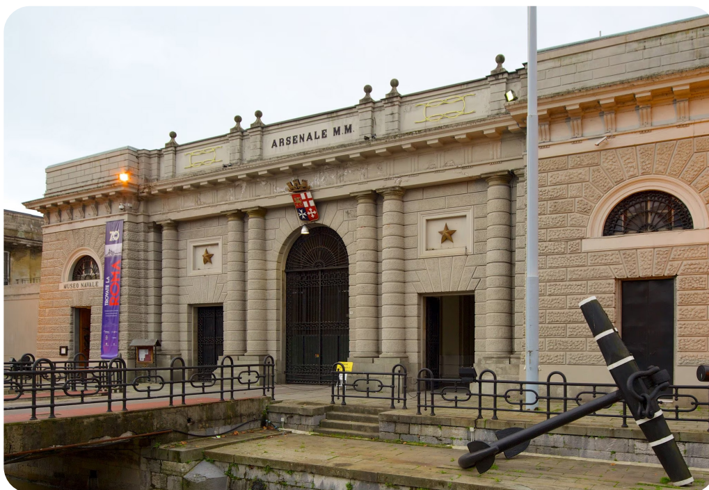
Museo Tecnico Navale della M.M. (Naval Technical Museum)

Located along the waterfront, this museum celebrates the city's maritime history, featuring models of ships, naval instruments, and exhibitions on naval warfare. It's a fascinating stop for anyone interested in technology, naval history, and La Spezia's strategic importance as a port city.