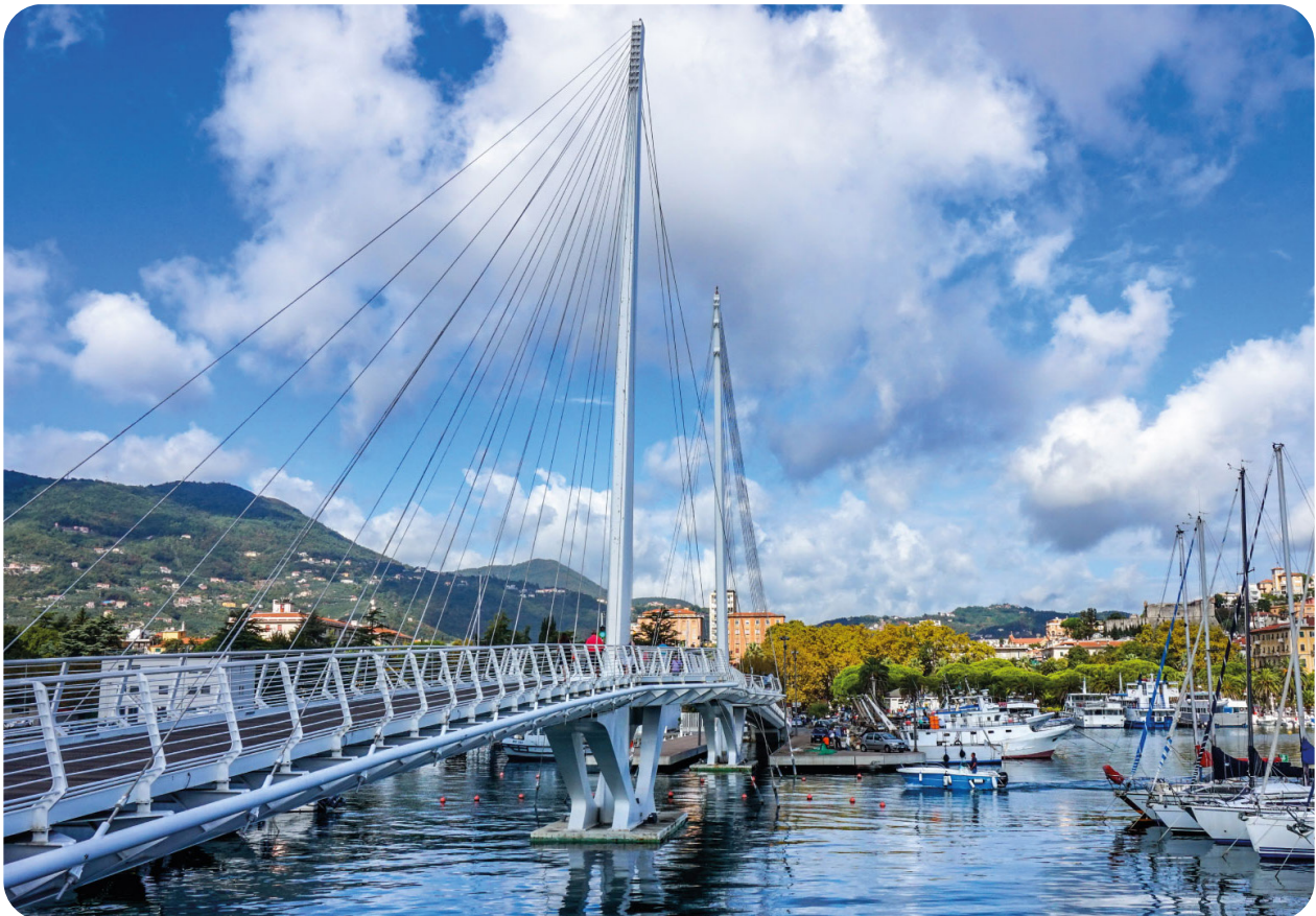
Bridge Thaon di Revel

Each of these sites offers something unique, providing a rich tapestry of La Spezia's culture, history, and artistic heritage for you to explore during your free time.