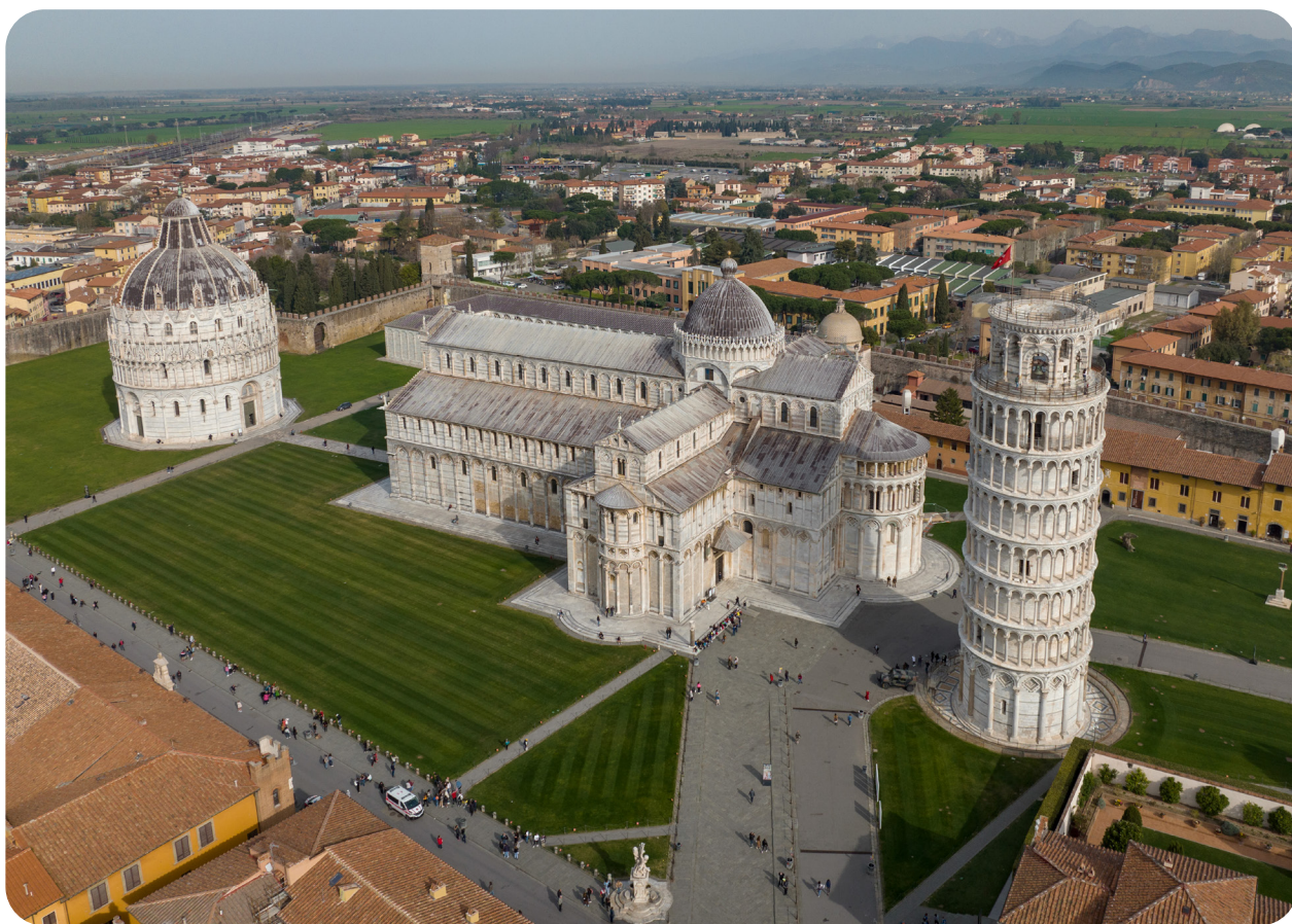
Pisa, Piazza dei Miracoli

This UNESCO site offers a peaceful blend of history and natural beauty.