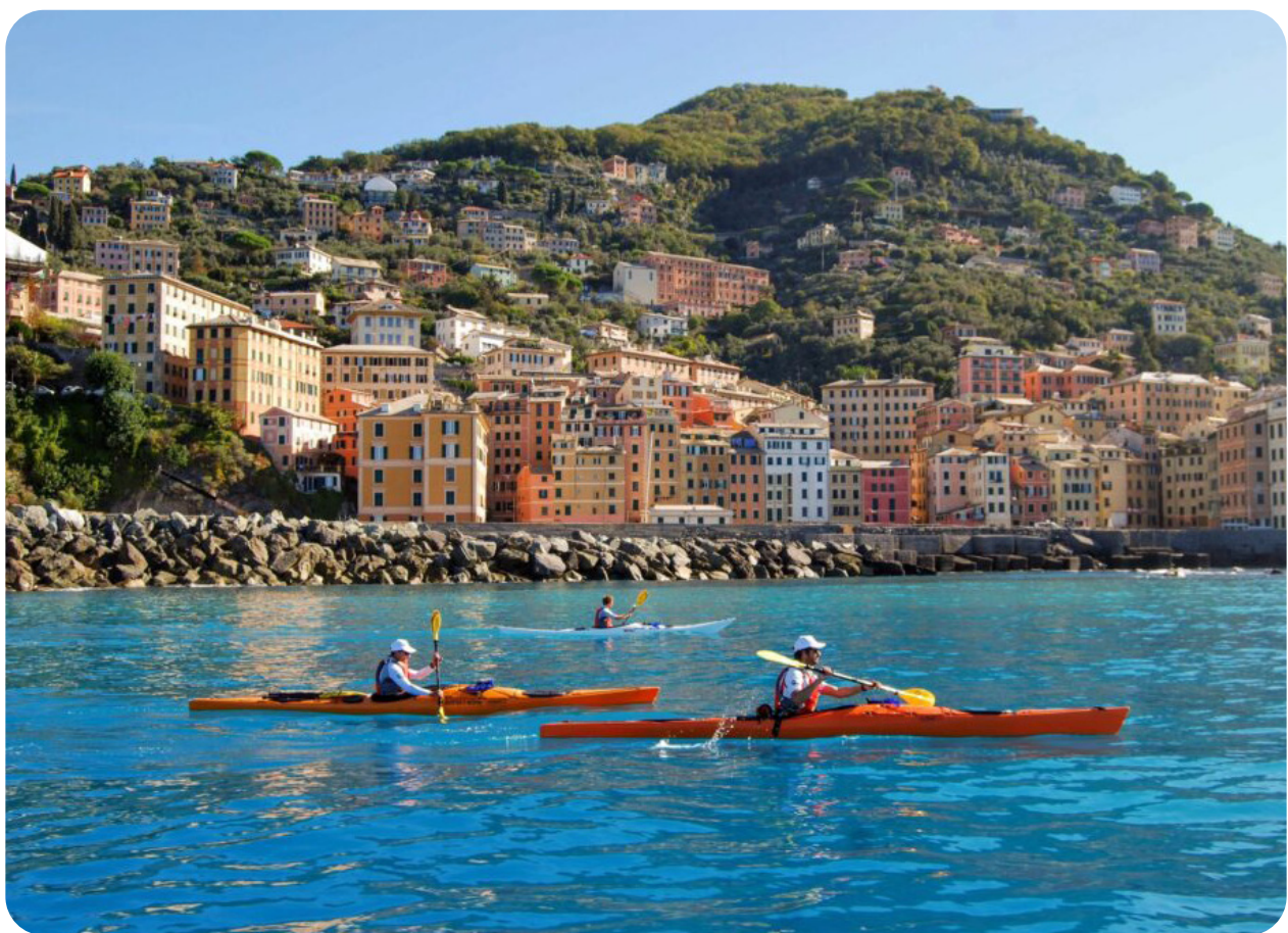
Canoeing and Kayaking along the Ligurian Coast

Spend a day lounging by the sea, swimming, or exploring the charming town of Lerici, known for its medieval castle and scenic views.