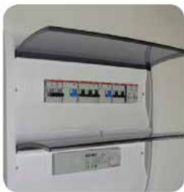
Apartment Electric Box